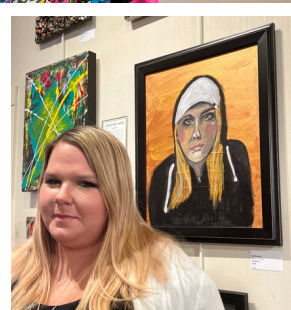
Artist of the Month