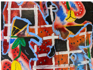
"Dark Snowball" by Deontray N. Acrylic on cardboard