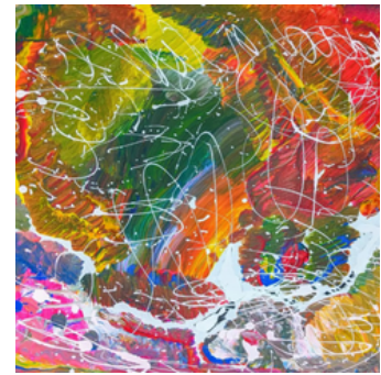
"Beacon of Hope" by Tessa B. Acrylic on canvas