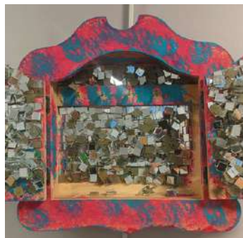
"Untitled" by Bridget D. Mixed media wood box with found objects