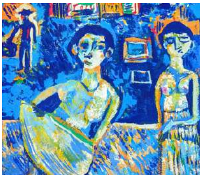
"Various Images" by Colin L. Original gouache paintings on paper (1 in a collection of 6 small images)