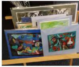
Artist's bin at Muddy Creek show.