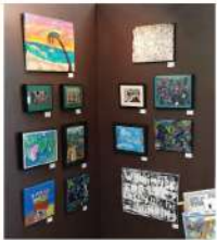
Panel of Open Eye Gallery artists' work at Muddy Creek show.