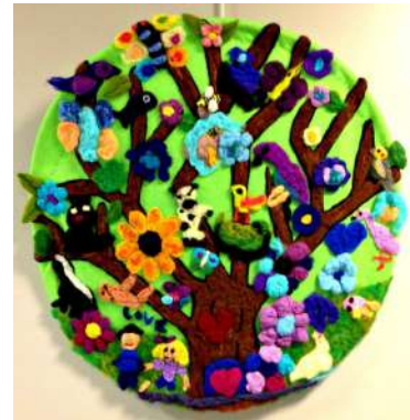
Tree of Life